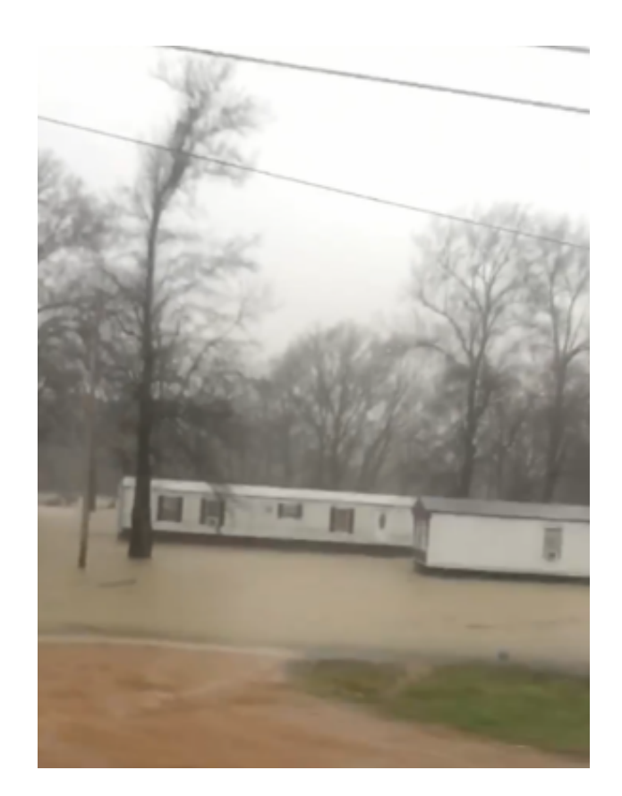
Tchula, Mississippi homes in recent flood conditions